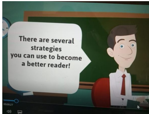
Picture 3. Powtoon video